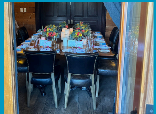
Table Setting at The Deane House

Interested in hearing more about this special evening? Join us at our 12th annual Sage Soirée to hear stories from those who were there!